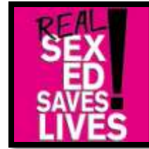
NO PROMO HOMO LAWS & LAWS THAT PROHIBIT ENUMERATION